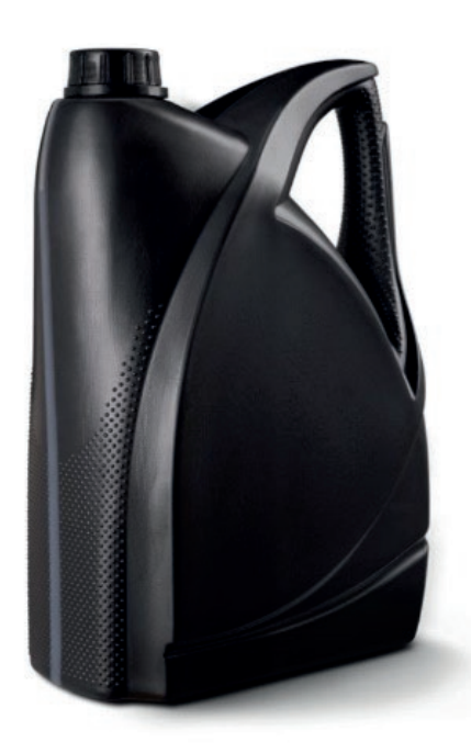
MAKROPLUS® CC 1500/HDPE 03 is an electroconductive concentrate based on HDPE and highly electroconductive carbon black CHEZACARB® AC.

MAKROPLUS® CC 1500/HDPE 03 is used in applications where permanent antistatic or electroconductive properties are required (e.g. ESD films, foils, packaging).